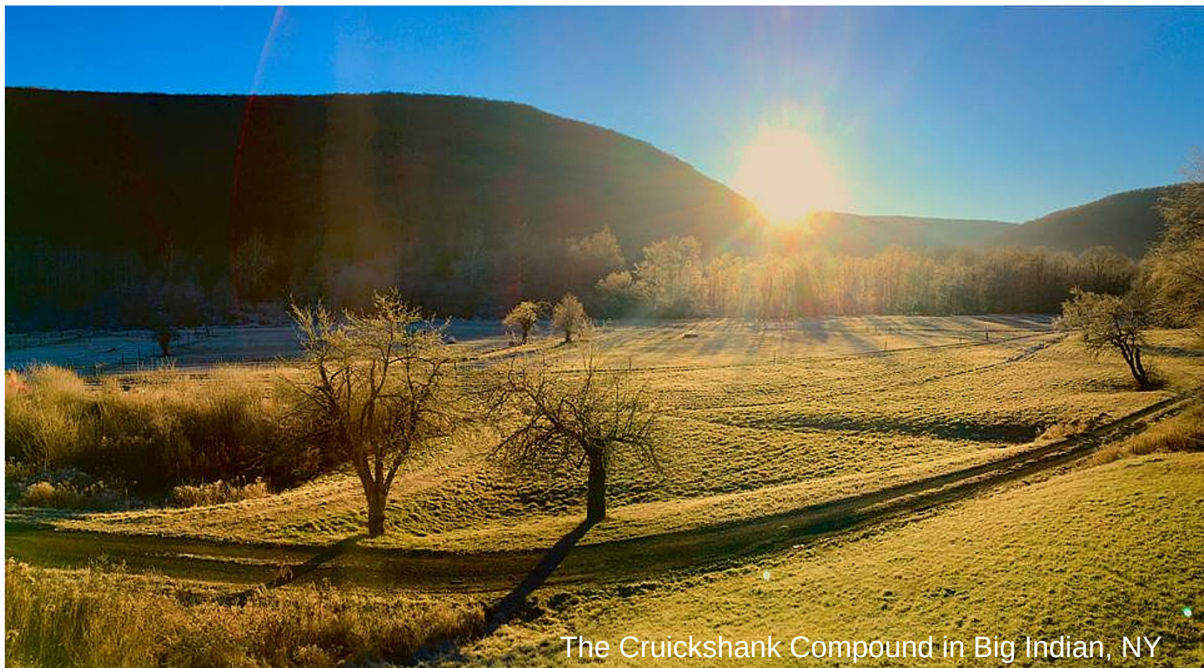
The Cruickshank Compound in Big Indian, NY